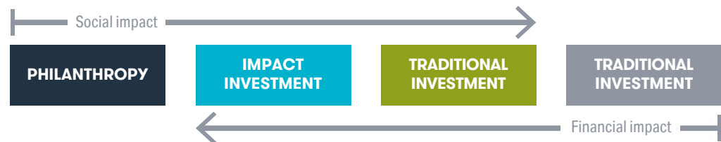
Figure 3. Balance sheet social and financial impact

From this point of view, there is a need for new financing instruments to stimulate social innovation, in which connection SIB is one of the options.